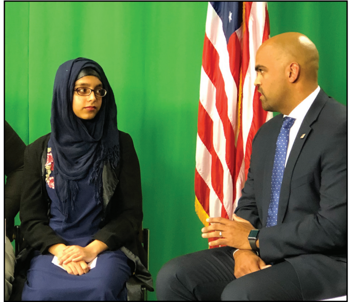
Speaking with US Representative Colin Allred