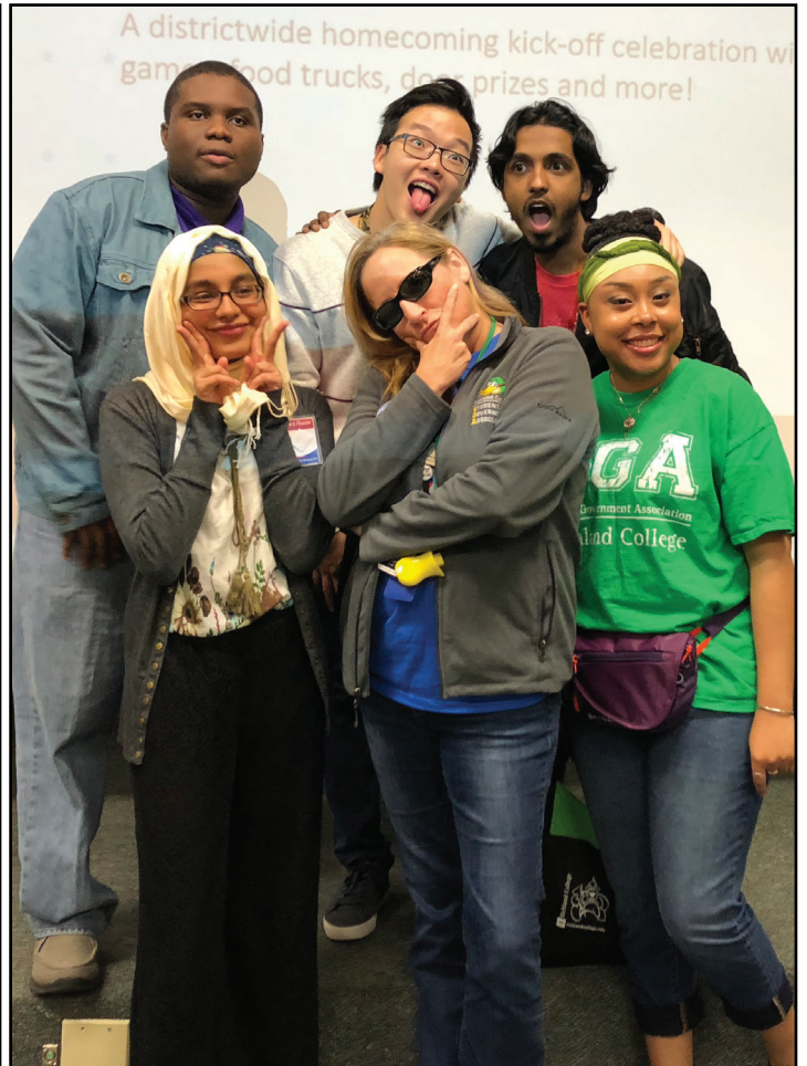
Having fun with the eBoard