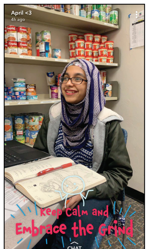
Working in the RLC Food Pantry