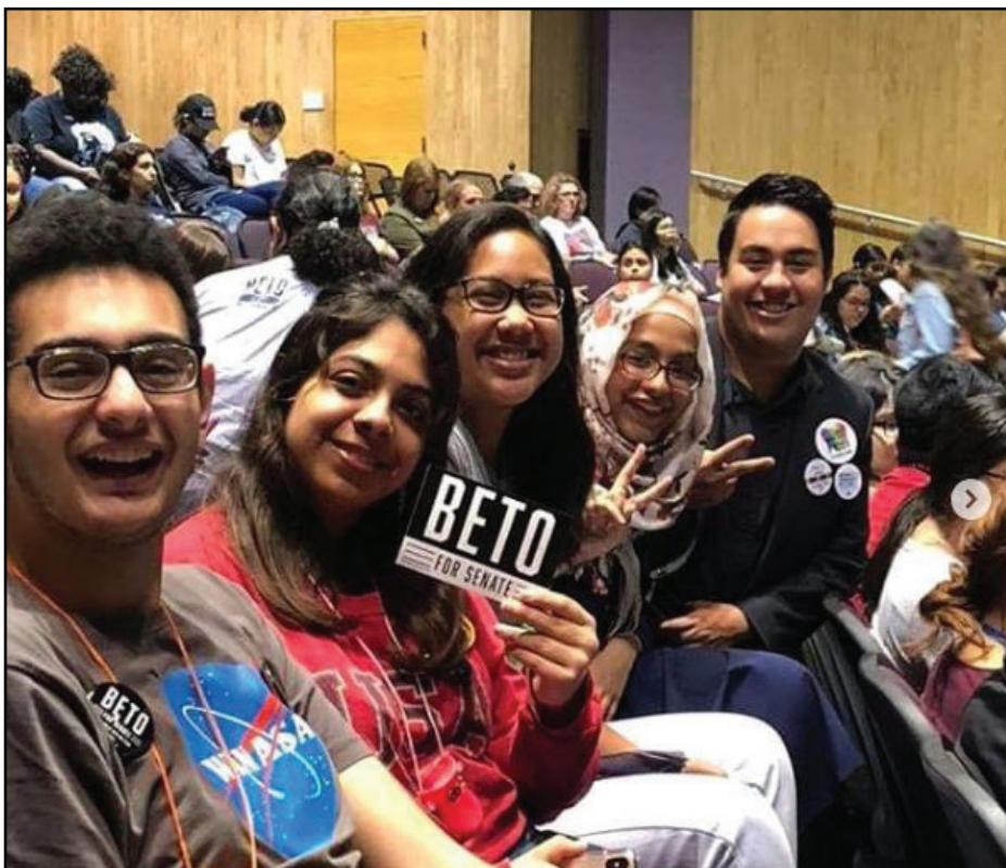
Supporting other SGA chapters at the Beto Rally (El Centro College)