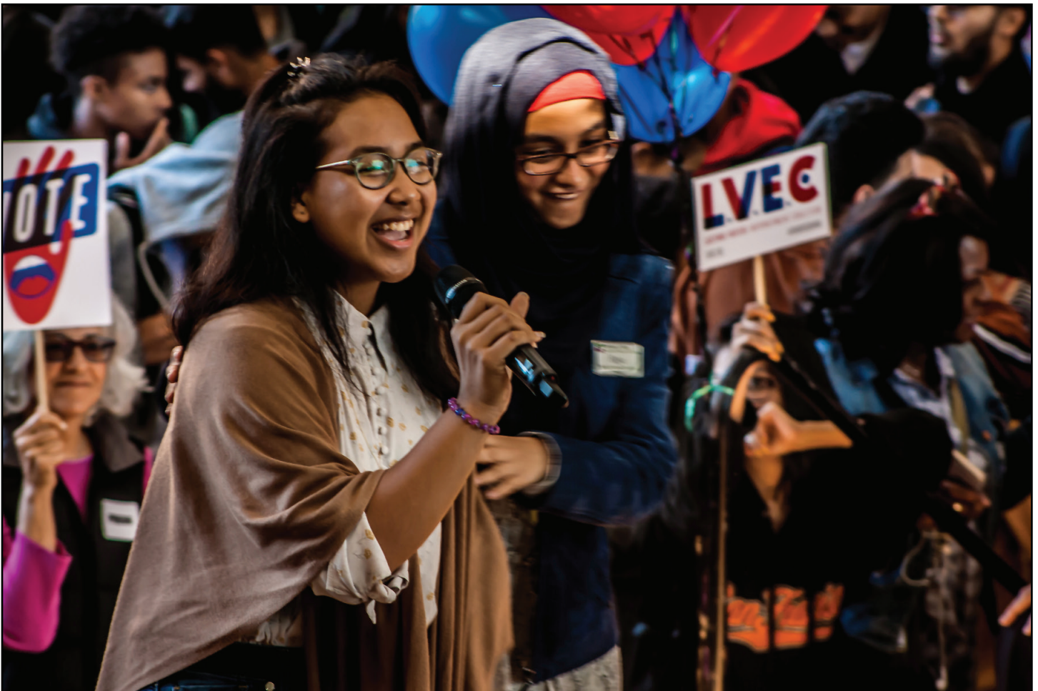
Speaking in front of 3200 people at the Richland Votes with America Rally