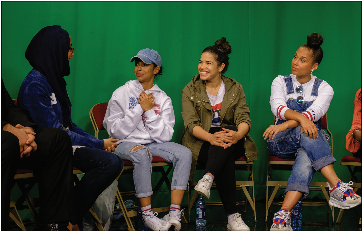
Asking her questions to Liza Koshy, America Ferrera, and Alicia Keys