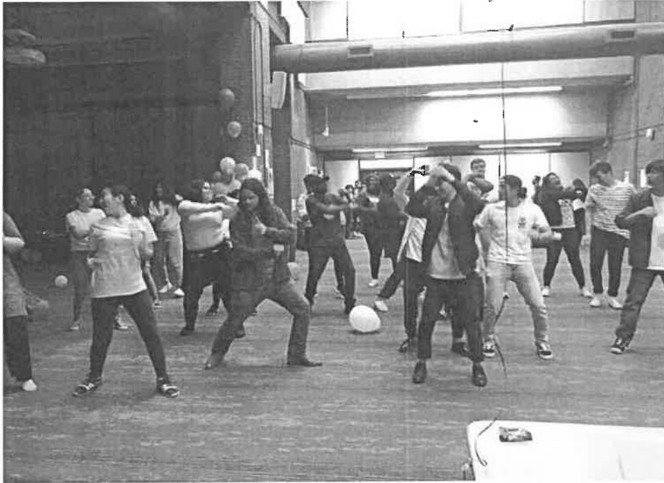
Our students letting loose on the dance floor. Our officers and students are enjoying being around one another in positive energy.