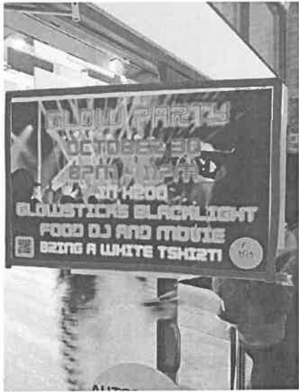
A look at one of the many flyers we posted around our campus to advertise the event.