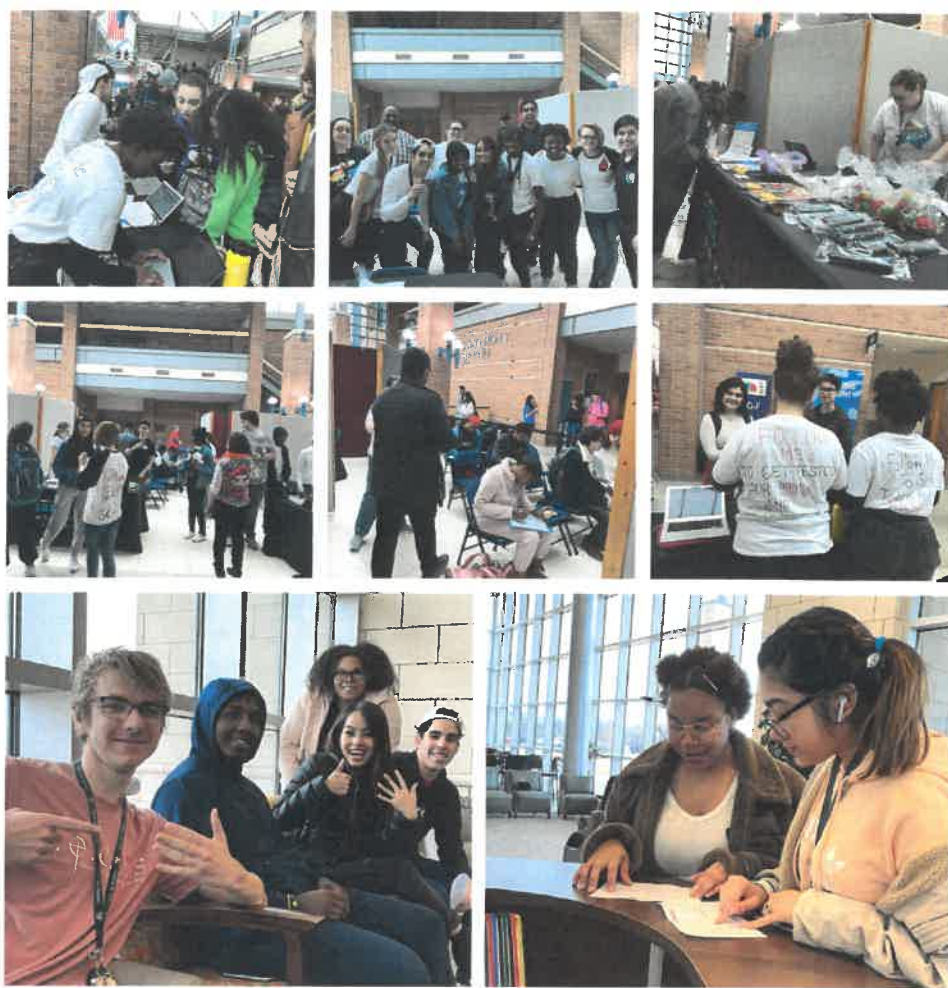
The Event Taking Place